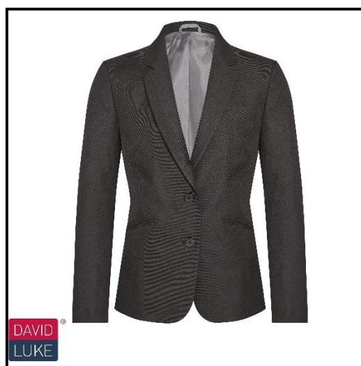
DL1995: Girls' Black Fitted Jacket