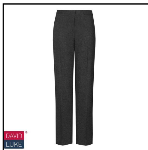
DL968: Girls' Regular Fit Trouser