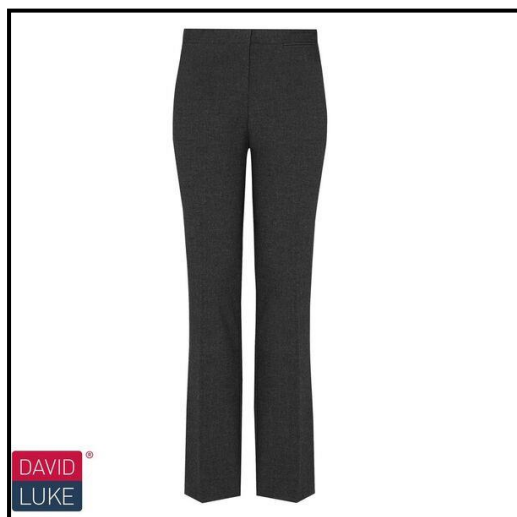
DL965: Girls' Black Slim Fit Trouser