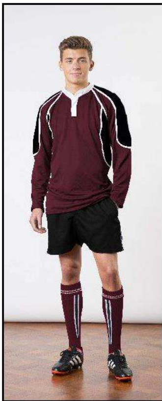
Boys' PE kit with rugby top and shorts