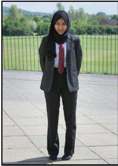
Girls' uniform with trousers