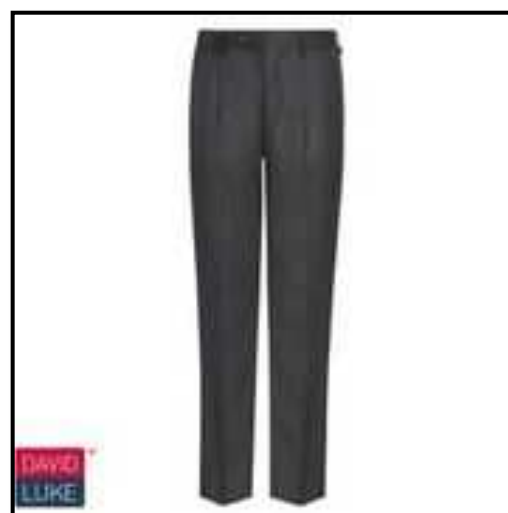
(DL943) Black Boys' trouser – elastic back