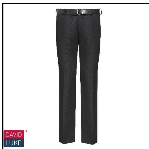
(DL959) Black Boys' slim fit trouser – adjustable waist – belted