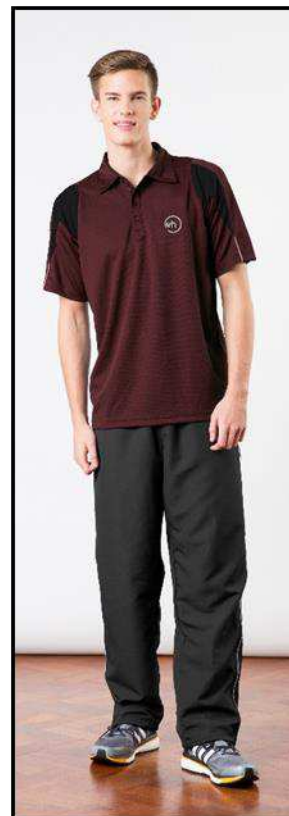
Boys' PE kit with polo shirt and track pants