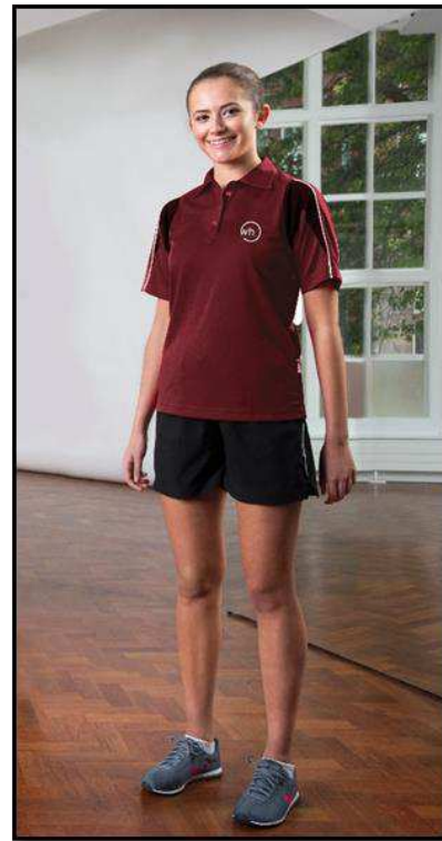
Girls' PE kit with polo shirt and shorts