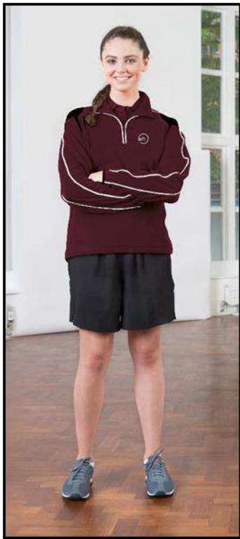
Girls' PE kit with fleece and shorts