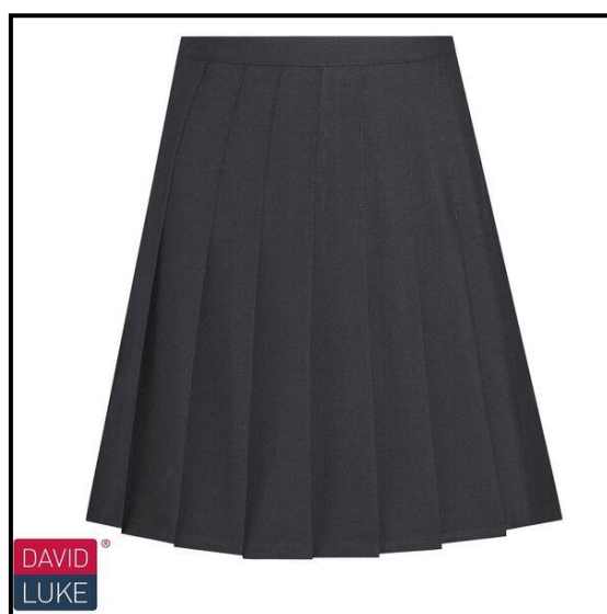
DL972: Girls' Black stitch down knife pleat skirt