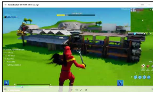
Dylan (7y2 WT) Shanty Town using Fortnite