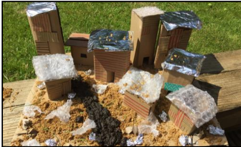
Ava (7x3 WT) Shanty Town Model