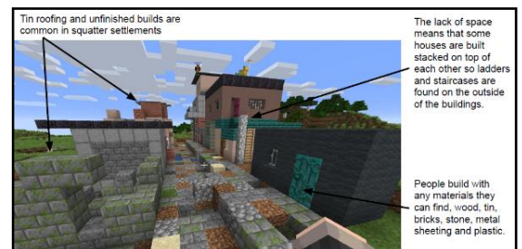
Bethan (7Ba5 BL) Shanty Town using Minecraft