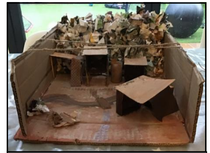
Emily (7x1 WT) Shanty Town Model