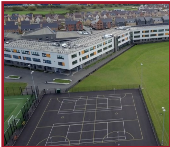
Walton High Brooklands Campus Fen Street Milton Keynes MK10 7HE

P|01908 677954 E| feedback@mket.org.uk W| www.waltonhigh.org.uk