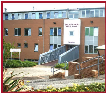
Walton High Walnut Tree Campus Fyfield Barrow Milton Keynes MK7 7WH

P|01908 677954 E| feedback@mket.org.uk W| www.waltonhigh.org.uk